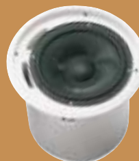
EVID C10.1 A COMPACT AND POWERFUL CEILING SUBWOOFER