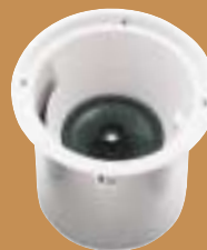
EVID C8.2HC THE EXCLUSIVE "PATTERN CONTROL" SOLUTION