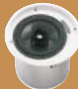
EVID C8.2 THE FULL RANGE POWERHOUSE