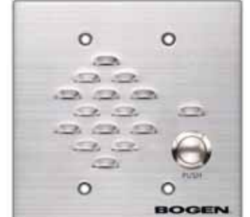
Shown without bezel frame